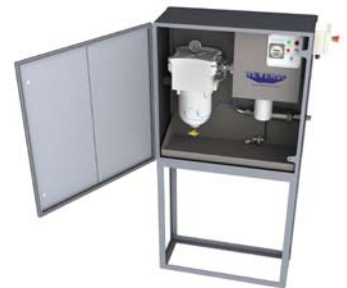
Enclosure with Stand