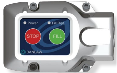
BFSZP2R - CONTROLLER

In today's competitive business world you cannot afford to waste fuel and time. Protecting the safety of staff and the environment is paramount. The leaders in hydrocarbon management, Banlaw, have developed Banlaw FillSafe™ to allow you to transfer fuel and other liquids safely and efficiently.