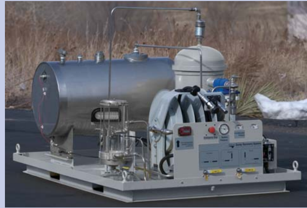
SRS (Sump Recovery System)

Velcon Filters manufactures hundreds of different filter cartridges, with a range of filtration efficiencies in a variety of configurations, to meet specific industry filtration requirements.