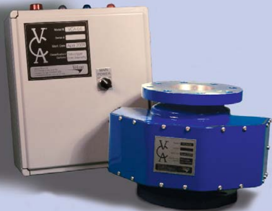
VCA ® (Velcon Contaminant Analyzer)