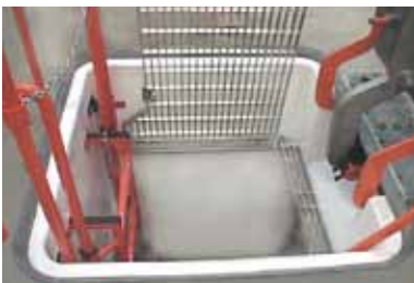
DAB-38 Vault Access Cover (965mm by 965mm opening)