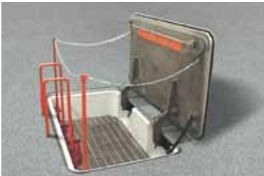
DAB-741 Vault Access Cover (1905mm by 1041mm opening)